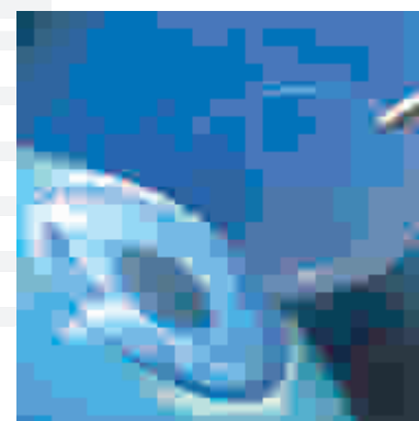
Intralase FS Corneal Flap