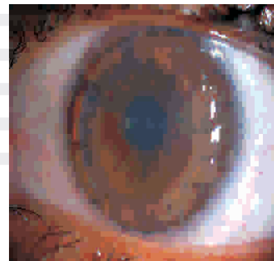
Intralase FS in Lamellar Keratoplasty